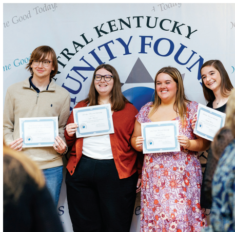
Recipients had fun taking candid photos after the program.

Over 450 recipients, parents, donors, and scholarship supporters attended the events. The programs were also featured virtually on CKCF's Facebook page and YouTube Channel. See a full list of recipients and scholarships on CKCF's website - www.ckcf4people.org .