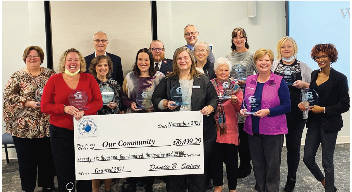
Fourteen community organizations were awarded grants through the inaugural year of Granted.

"Through the generosity of our donors, along with the foresight many years ago of people who gave to this community in a long-term and thoughtful way, we have the opportunity each year to make