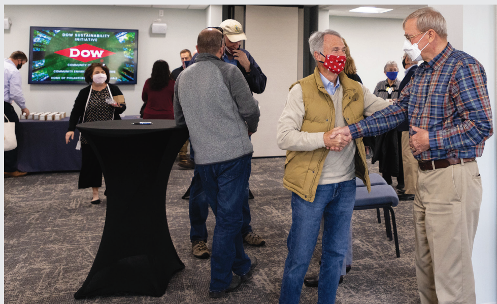
It was great to come together for this announcement in the Home of Philanthropy's Community Hall.

If you are interested in being involved, please contact CKCF at info@ckcf4people.org .