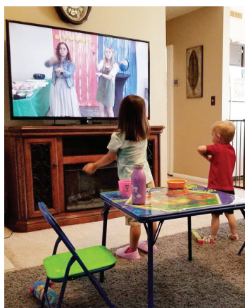
Two children dance along to "Baby Shark" during Get Ready! Camp.

Get Ready! Camp provided each participant a free Grab Bag of supplies needed for the week's activities. Teachers prepared the lessons and the supplies for up to 350 preschool-aged children each week. Using the virtual format, participation increased this