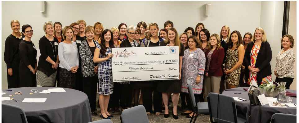
Heels Together Investors present a grant for $15,000 to representatives from Elizabethtown Community and Technical College for its Camp Forge Ahead program for middle school girls to learn about traditionally male-dominated career paths.