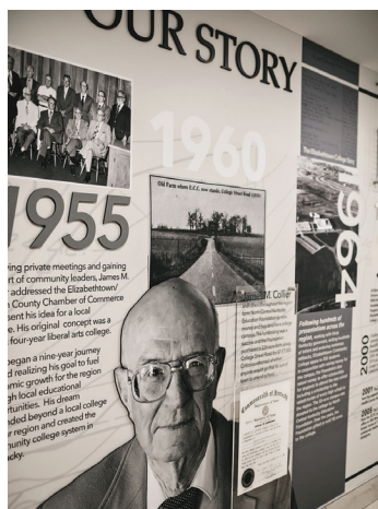
A timeline of our history leads guests to the Community Hall.