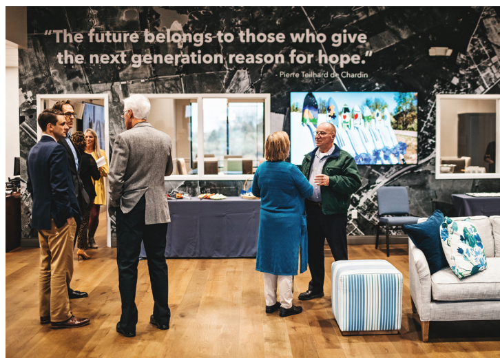
Guests at the Home of Philanthropy's Grand Opening celebration socialize in the main lobby. A mural of the original land purchase for the foundation adorns the read wall.

"We feel like whenever our bank gives money, we want it to be pointed and directed and highly