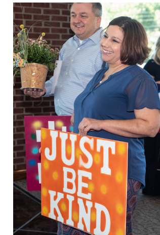
Guests of the luncheon took home Just Be Kind signs, mum centerpieces and candles as parting gifts.