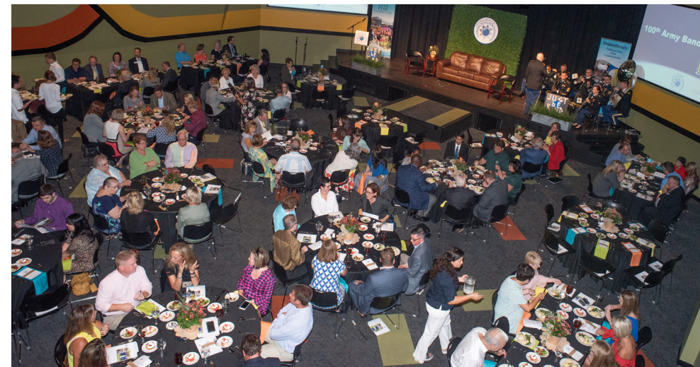
Central Kentucky Community Foundation's Celebrating Community Philanthropy luncheon was held Sept. 20 at Grace Heartland Church in Elizabethtown.