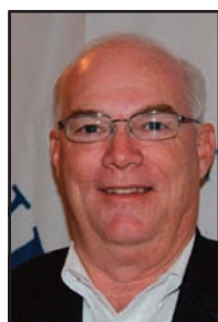
State Senator Dennis Parrett