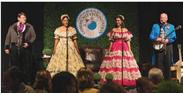
Stephen Foster Drama Association

CKCF's annual celebration brought together people from around the region to celebrate Philanthropy Giving Life in our communities. Philanthropy Gives Life by establishing ideas that create, strengthen and inspire opportunities for the betterment of others. If you can dream it, CKCF can help bring your charitable goal to life. And what an honor to see those dreams become reality. A dream to help bring excitement to girls about the STEM (science, technology, engineering and mathematics) field, to the reality of Shattered Glass, a STEM workshop for girls; a dream of giving back to local students, to the reality of the Elizabethtown High School Class of '66 Scholarship; a dream of creating a foundation to support the Elizabethtown Police with resources and in times of need, to the reality of The Elizabethtown Police Foundation. What philanthropic dream can you give life?