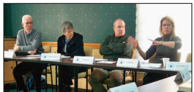
Board members consider initiatives during a Board meeting